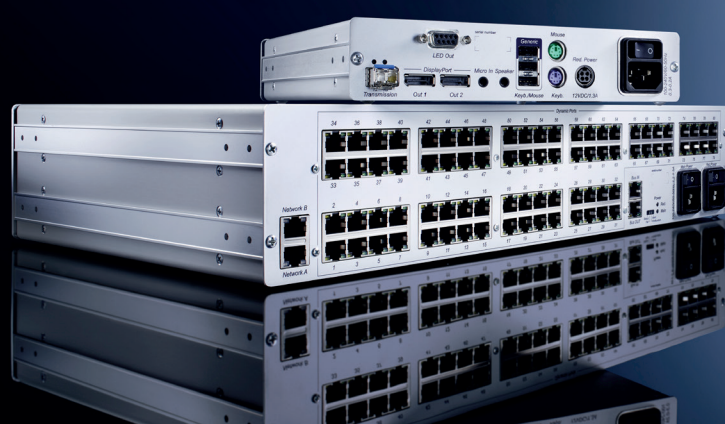
Matrix terminals mounted in G&D DeviceCarrier